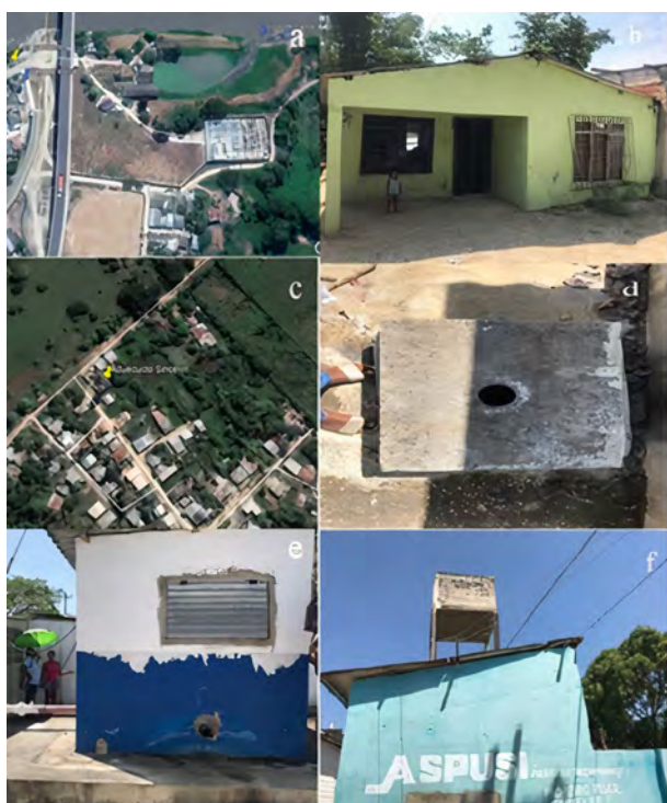
Figure 2 Sampling locations (a) Gambote's raw water sampling point (GAMB); (b) House near the Canal del Dique after alum addition (GAMBT); (c) Sincerín's well location; (d) Closeup of Sincerín's Well; (e) Pipeline connected to Sincerín's well where raw groundwater samples were collected (SINC); (f) Aqueduct offices (SINCT).